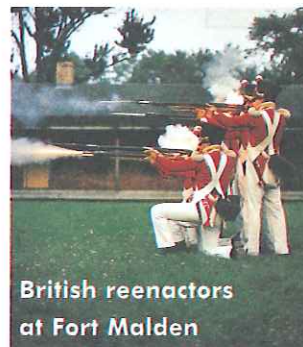
British reenactors at Fort Malden

During the War of 1812, Fort Malden was the center of British defenses on western Lake Erie. Today, the site includes remains of defensive earthworks and four buildings, including a brick barracks built in 1819. The fort is located on Laird Avenue in Amherstburg. Telephone (519) 736-5416 or visit on-line at http://parks.canada.pch.gc.ca/parks/ontario/fort_malden .